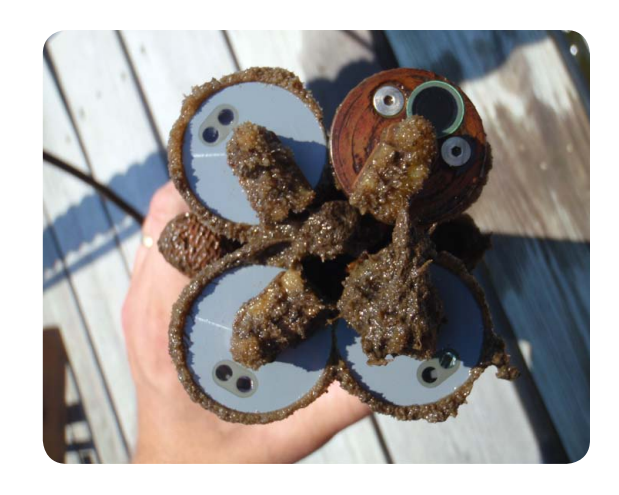
Copper tape, copper-alloy sensor guard and mesh screen would provide additional anti-fouling protection to the equipment above and at left.