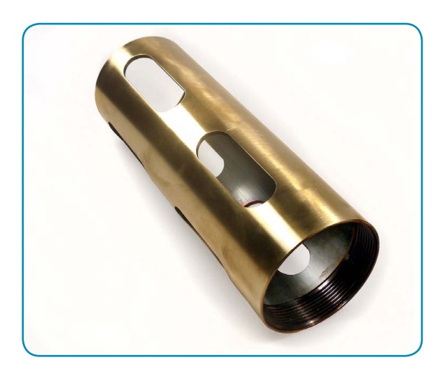
Copper-alloy sensor guards effectively deter biofouling settlement on sensitive water quality sensors. As the guard ages, it naturally gains a patina.